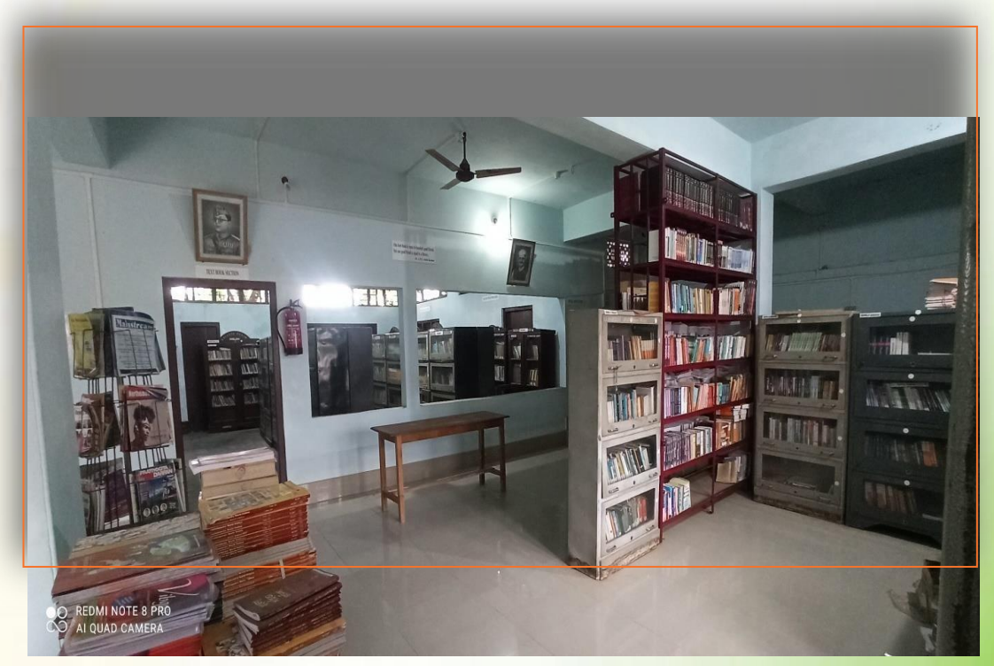
R.K. Nagar College Central Library