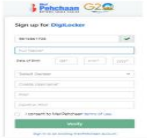
Step 6: Click at Verify OTP then the following screen will be displayed and enter Full Name, Date of Birth, select Gender from drop down menu, create your own User name, PIN( password: PIN must be 6 digits numerical only) and confirm PIN number. Then Tick the checkbox against 'I consent to Meri Pehchaun'