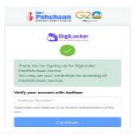
Step 8: Enter OTP sent to mobile number linked to Aadhaar number and click at submit link